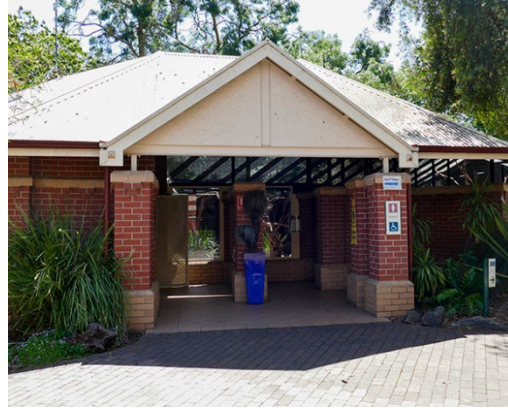
Toilets near the Rotunda

The hand dryers and the toilets flushing can be loud. I can cover my ears with my hands or use my headphones.