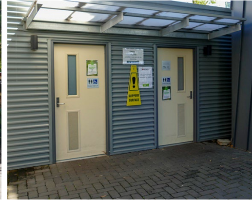
Toilets next to Wisteria Restaurant