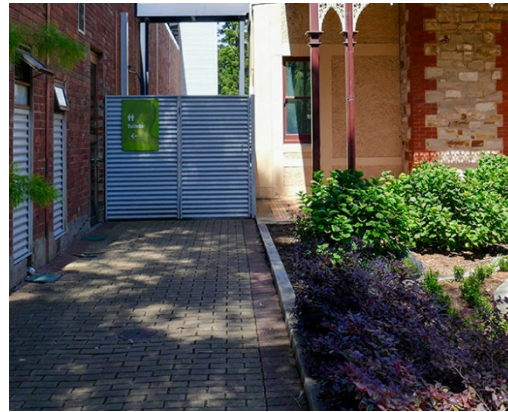
Toilets near the Envirodome